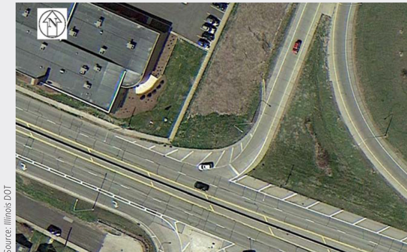
Illinois DOT restriped this right-turn lane to create a safer turn.

These behaviors contributed to a 59 percent reduction in approach crashes at the modified sites. Conventional designs with low right-turn angles and high head-turn angles had significantly higher crash rates. When the costs of modifying the intersections were annualized over 15 years, the safety benefits exceeded the costs by a factor of 14 to 1. Final report.