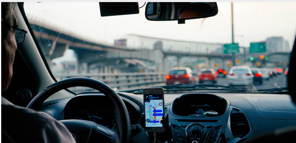
Training and real-time feedback in the vehicle helped Massachusetts DOT employees drive more safely while reducing emissions and improving fuel economy.

The research team concluded that the combination of training and real-time feedback can significantly improve fuel economy, reduce emissions, and improve safety. Final report.